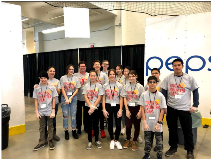
YVC Airdrie youth volunteered at the Airdrie 2020 Alberta Winter Games in February, 2020.

CRA Charitable Organization #809648454RR0001