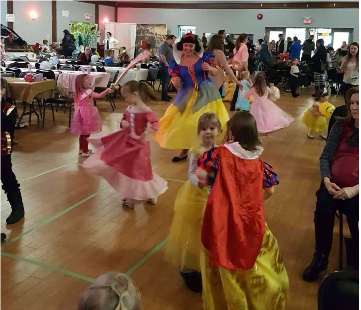
Volunteer Airdrie's second annual Pirate & Princess Gala in February, 2020 was a success as a joint fundraising event with Soap for Hope.

Volunteer Airdrie 2020 financial statement were prepared by a third party, independent professional accountant, and are included below.